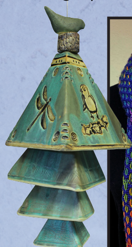
Rosemary Tobiga - ceramics