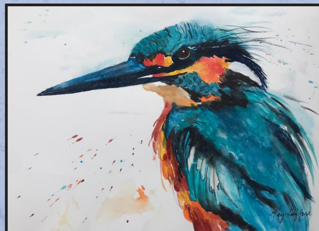
Kay Gifford - watercolor