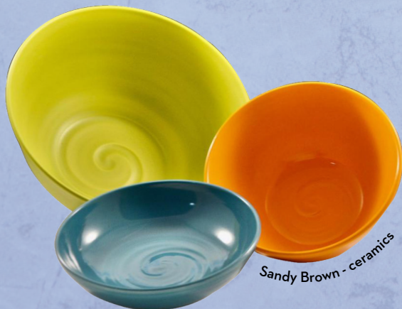
Sandy Brown - ceramics