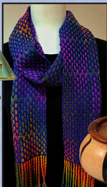
Peg Silloway - fiber