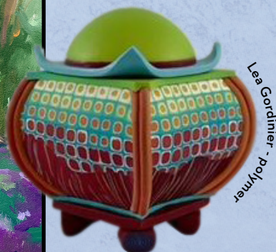
Lea Gordinier - polymer