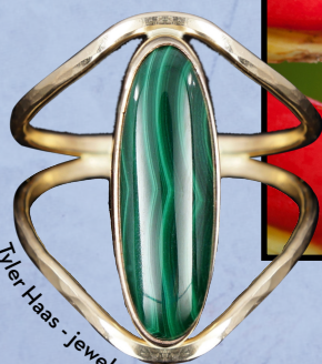
Tyler Haas - jewelry