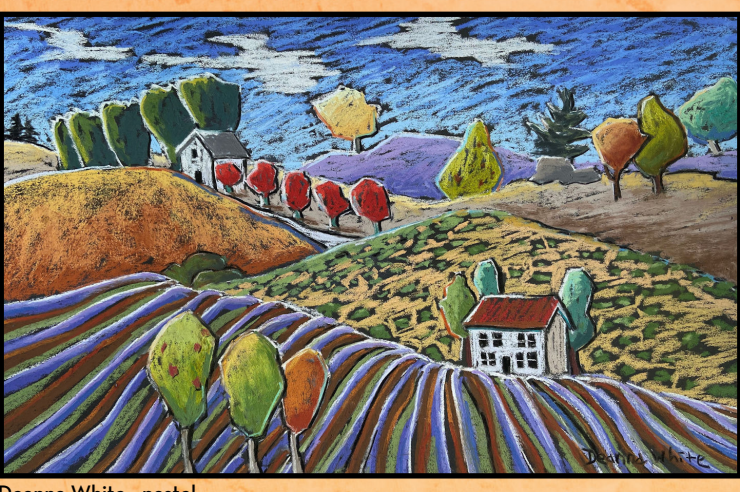
Deanna White - pastel