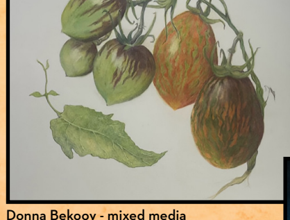
Donna Bekooy - mixed media

WORSHIP IN THE ART 10am-11am EXHIBIT & SALE 11:30am-3pm