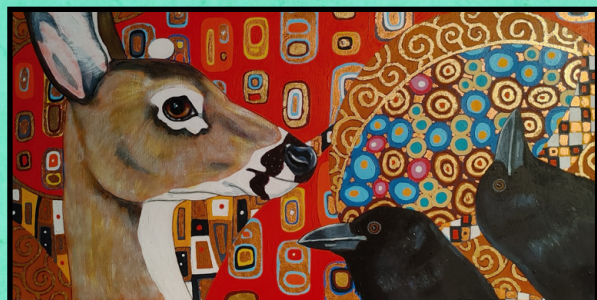
Nancy Coffelt - acrylic gouache