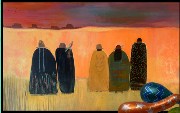
Pamela Prideaux - acrylic