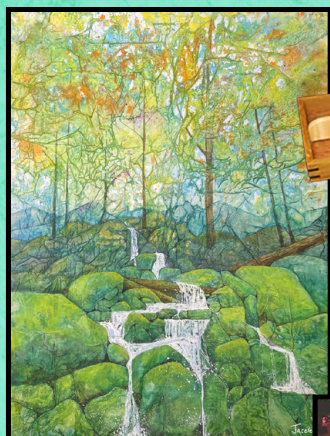
Jacelen Pearson - mixed media