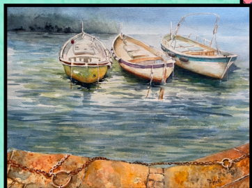
Dianne Hicks - watercolor