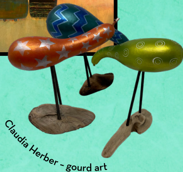
Claudia Herber - gourd art