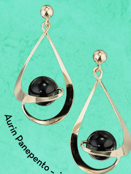
Aurij Panepento - jewelry