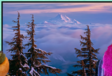
Bruce Lee - photography