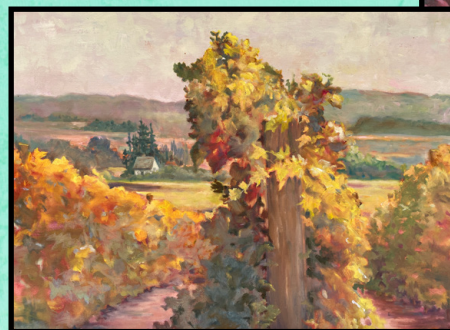
Toni Tyree - oil