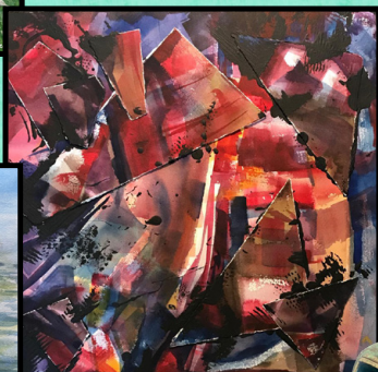
Mojden Bahar - water media